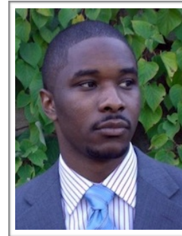
Brandon Terry Prize Fellow in Economics, History, and Politics